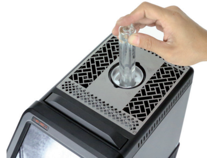
Accuracy Verification Loop