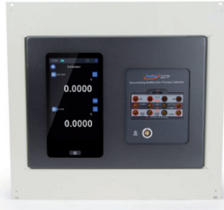
Panel Mount Version

ADT226 ADT226Ex: Intrinsically Safe ADT226P: Panel Mount